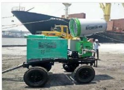
TRACTOR TROLLEY (FT) Seawater Application