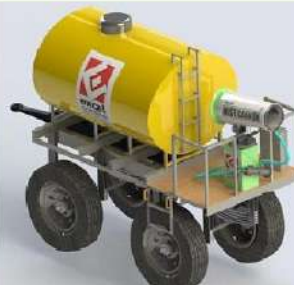
TRACTOR TROLLEY (T)