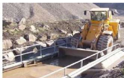
Cleaning the recycling tank with a wheel loader