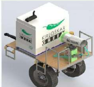
TRACTOR TROLLEY (G)