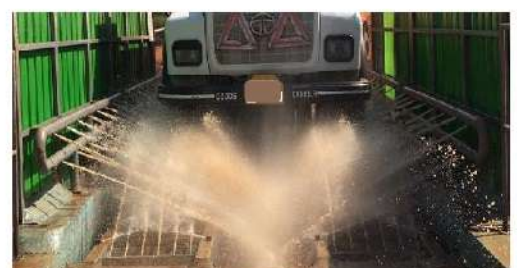
Effective washing with side and bottom nozzles